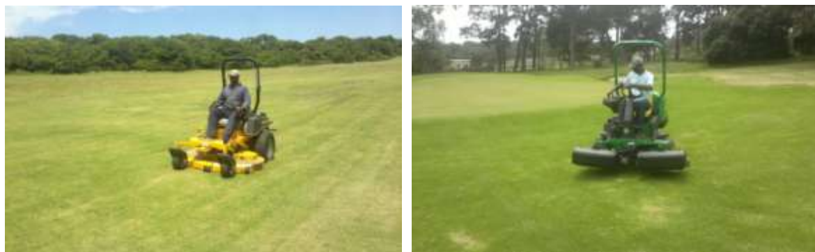
Whelile & Phillip on older machines